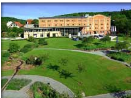
Alte Maelzerei/Congress venue